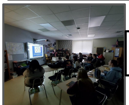
Students learn about coding in advisory this week!